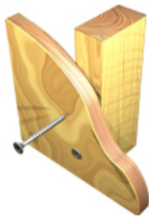
Flat Head Ribbed Coarse Thread

Certifications: All GRABBER® screw products are manufactured in facilities that are ISO 9002 and ISO 14001 certified and approved. The fasteners comply with ASME B18.6.1, as referenced in ICC ER report ER-5280, are approved for use in structures governed by the International Building Code 2006, 2009, 2012, International Residential Building Code 2006, 2009, and 2012. ©2012 GRABBER Construction Products, Inc. GRABBER®, STREAKER®, DRIVALL®, LOX®, GRABBERGARD® and SCAVENGER® are registered trademarks of Grabber Construction Products, Inc.