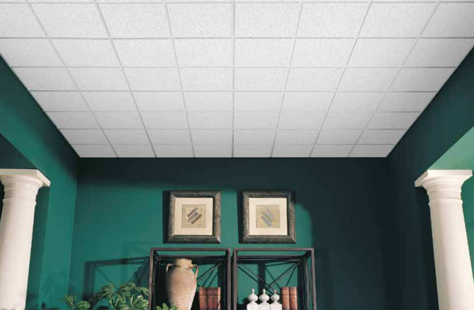
Cashmere® High NRC Reveal (CM-454NRCP)