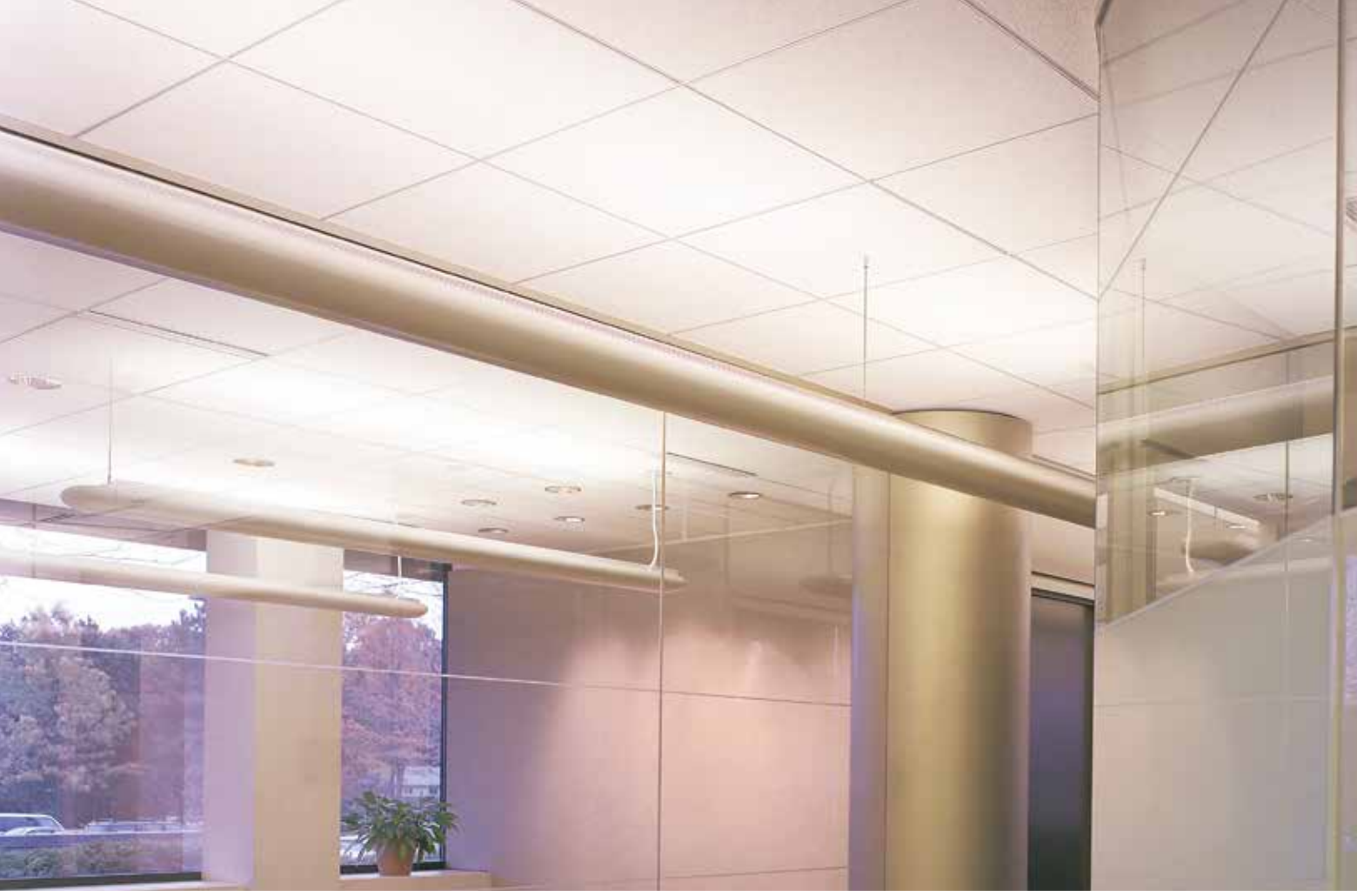
Adagio® Narrow Reveal (1662F-IOF-1)